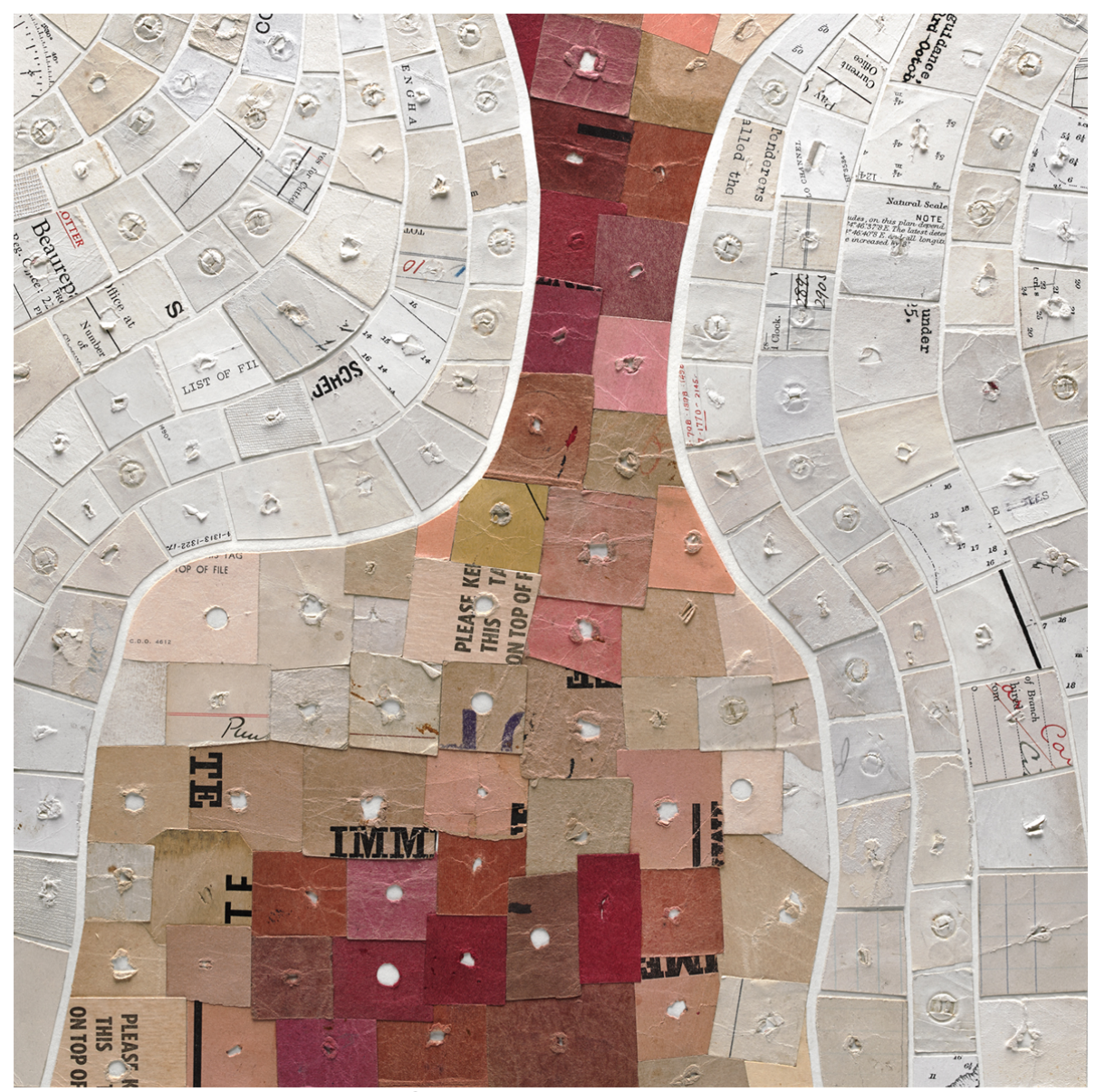
Inlet / Outlet, collage on paper, 2013